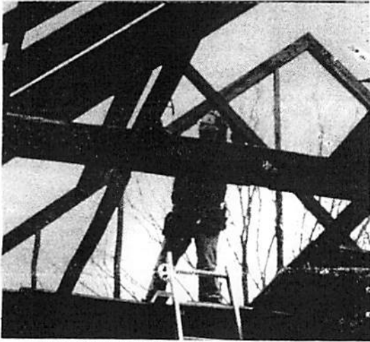
Hugh Dahlen carefully labels and removes a beam.